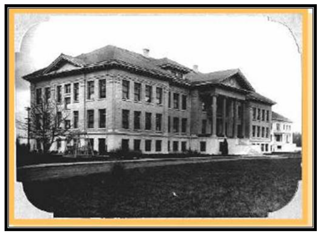
Oregon State Deaf School (1910)

Friends of OSD was created not to replace or supplant the responsibilities of the State of Oregon which has administrative responsibility for the School. Rather, FOSD operates as an independent nonprofit to assist OSD by enhancing the education experience for students.