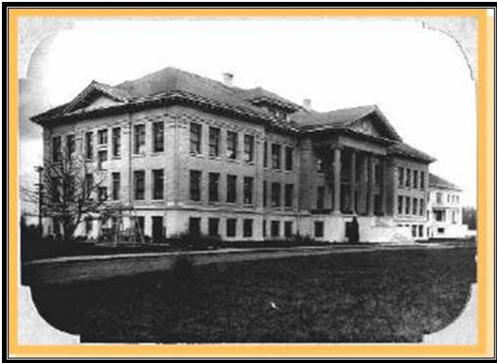
Oregon State Deaf School (1910)

Friends of OSD was created not to replace or supplant the responsibilities of the State of Oregon which has administrative responsibility for the School. Rather, FOSD operates as an independent nonprofit to assist OSD by enhancing the education experience for students.