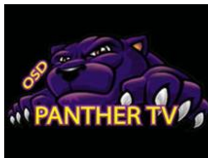
Family Learning Program

FOSD purchased professional-quality digital video cards, adjustable light stands, a 10’ x 20’ green screen and a green suit, allowing students to experience and learn from the enhanced professional-level broadcast studio of Deaf Panther Productions .